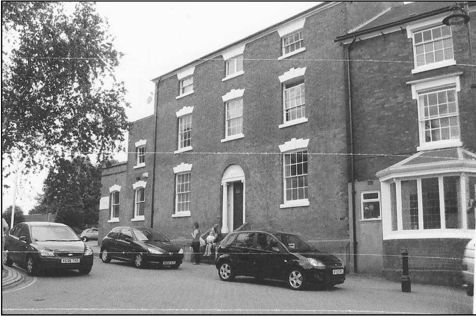
This view depicts No 24 and part of No 25 Great Cornbow in Halesowen