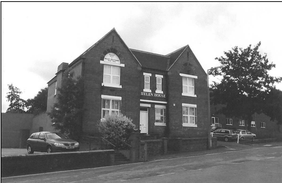
Shown here is the Halesowen Institute at 16 Great Cornbow, Halesowen