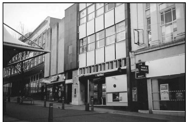
Kidderminster High Street, looking up towards Worcester Street and showing the Nat West Bank, the site of the old retail market.