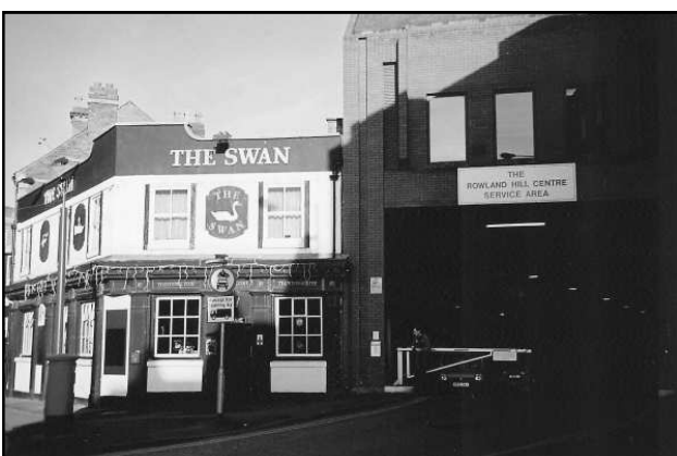
At the bottom of Vicar Street stands the Swan pub and at the rear was the exit from the retail market, where now is the Rowland Hill Centre service area.