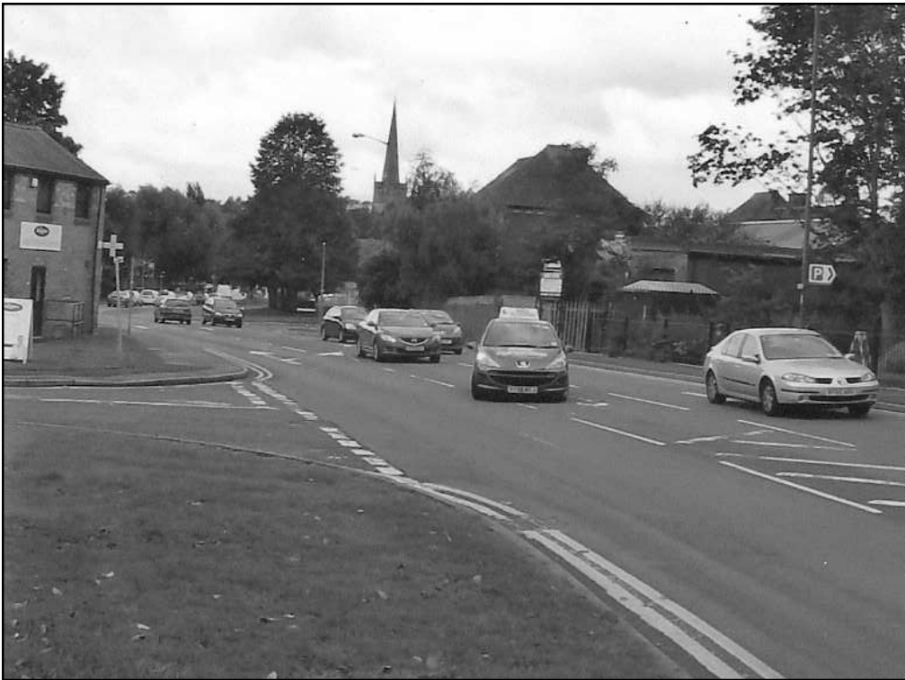
Market Street in Bromsgrove looking towards St John's Church. This was a minor road until the second half of the twentieth century, when it became a by-pass. At the same time High Street was pedestrianised.