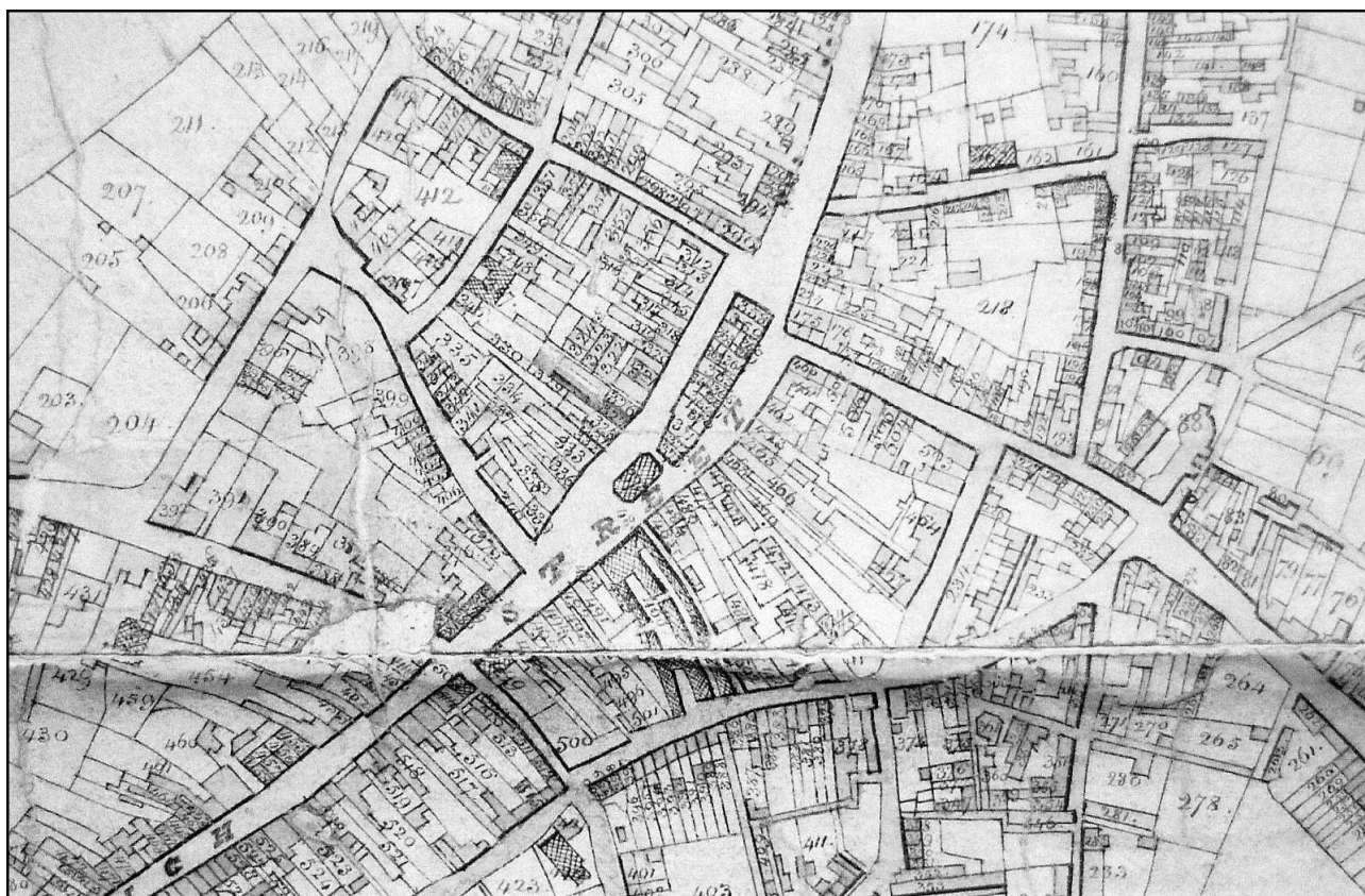
Dudley town centre in 1825

Clark C.F.G. - Curiosities of Dudley and the Black Country.