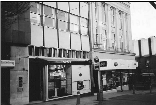
Kidderminster High Street. The Nat West bank is where the retail market was located.

Barber R, Images of England-Kidderminster Vol I & II