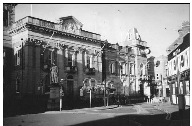
At the bottom of Vicar Street is located the Town Hall and where opposite was the rear entrance to the retail market.