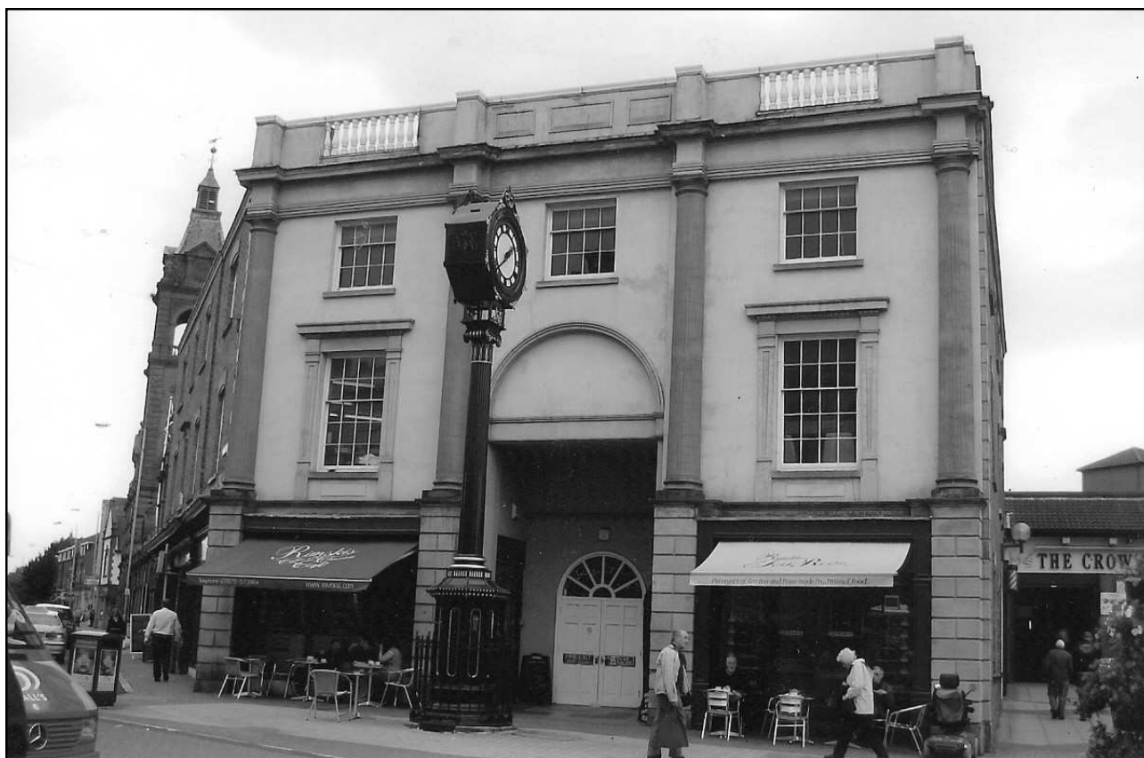
The surviving classical facade of Stourbridge Market Hall. The Market Hall was built in 1827 and demolished during the 1980s. The clock was erected in 1857 and electrified in 1972.

Alongside the market hall a corn exchange was built in Market Street in 1850. This was used as the town's centre for meetings and concerts