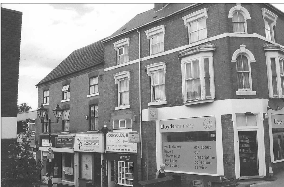
In this photograph Nos 9-11 Peckingham Street can be seen.