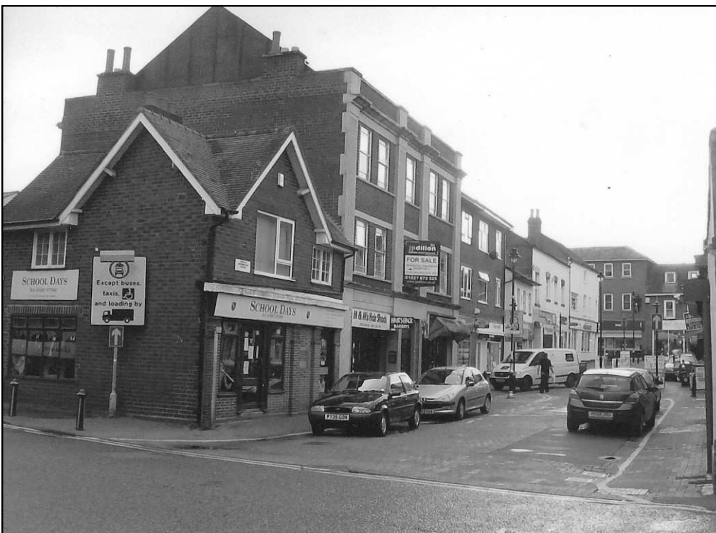
This view is looking up Church Street from Market Street to High Street.